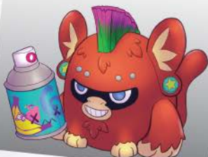
(PUNKY MONKSY) + DJ DRIPZ