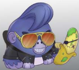
(GREASY GORILLA) + BAD BENNY