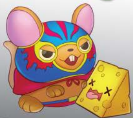
(LUCHADOR MOUSE) + CHEDDA CHAMP