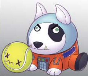
(LOONY LAIKA) + ACE