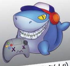
(SHARKATTACK_64) + SHOCKY