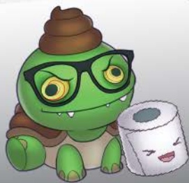
(TURDY TURTLE) + DINGLEBERRY